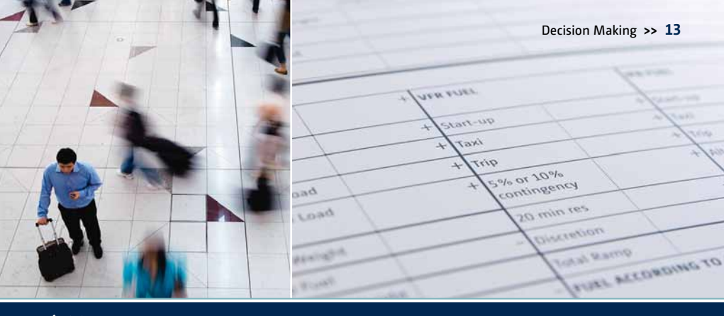
↑ (F) STRESS AFFECTS PILOTS' JUDGEMENT – THINK ABOUT PRE-FLIGHT PLANNING